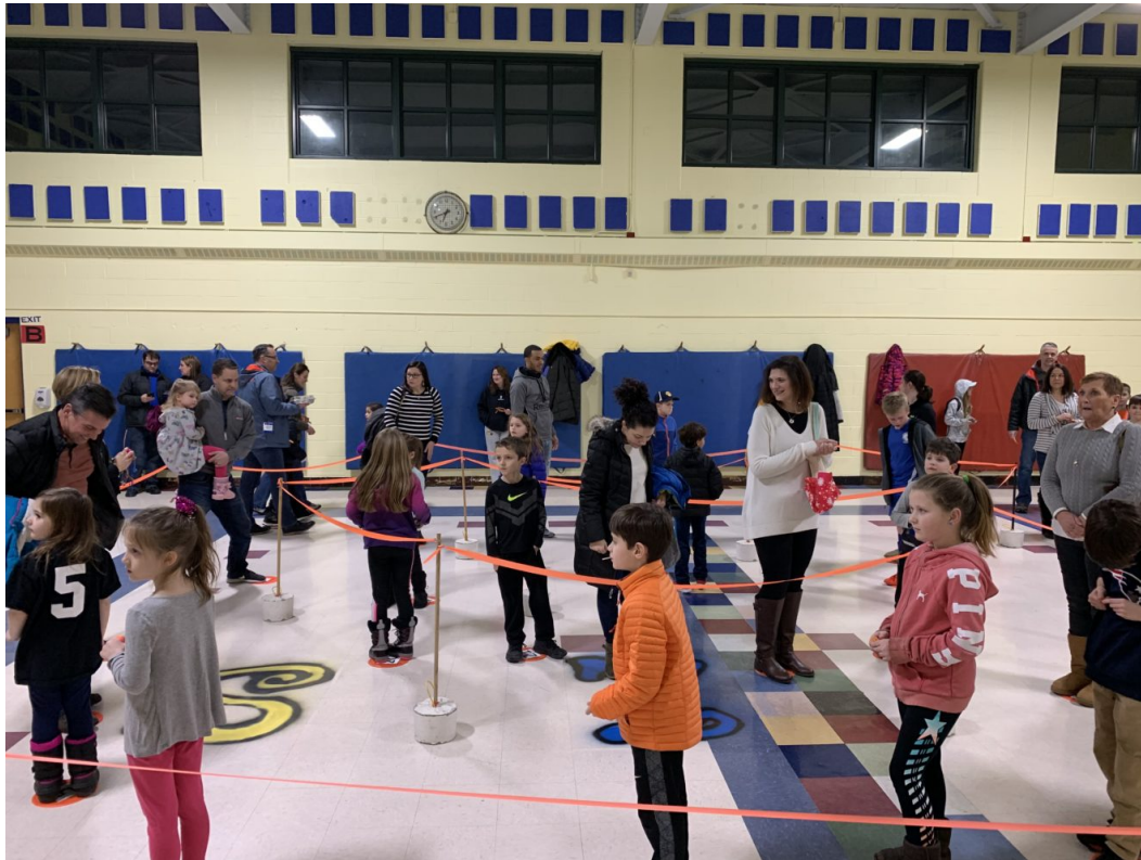
Students participate in the Cake Walk at Shaker Lane's Winterfest.